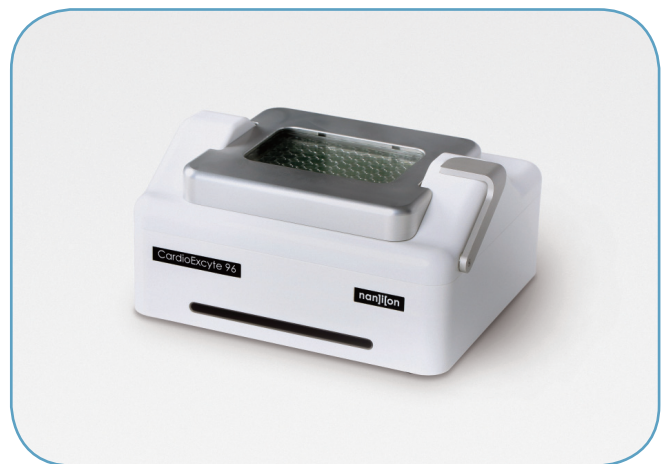
The CardioExcyte 96 with a Nanion NSP - 96 sensor plate