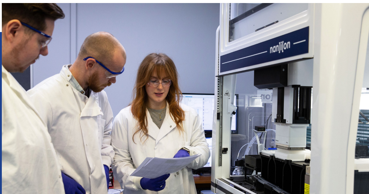
SB Drug Discovery scientists utilize multiple high-throughput SyncroPatch 384 platforms to deliver robust, high quality electrophysiology data to support their global customers.

The collaboration resulted in two recent publications 1,2 , highlighting the capabilities of two technologies, and the importance of a holistic approach to investigating therapeutically relevant targets. One of them the lysosomal cation channel TMEM175 is a Parkinson's disease-related protein and a promising drug target 2 . Together, SB and Nanion performed functional characterization of TMEM175 in lysosomes using SSM-based electrophysiology, and developed an HTS-compatible assay mode to study and characterize compounds that modulate TMEM175 using the same technology. Groups also compared the results obtained from this assay with those obtained from whole-cell APC and LPC recordings, providing a comprehensive perspective on the compound effects on TMEM175 across different experimental approaches and assay conditions 2 .