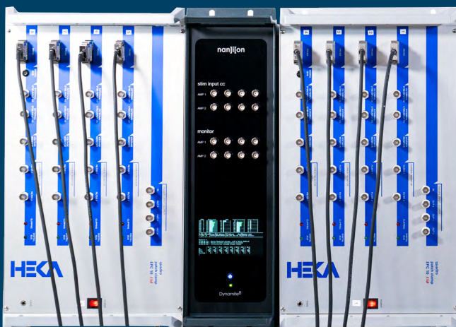
Patchliner with Dynamite 8

The Patchliner is a fully automated planar patch clamp instrument recording from up to 8 cells simultaneously. With its vast experimental freedom and gigaseal data quality, the Patchliner is one of the most versatile patch clamp instruments on the market.